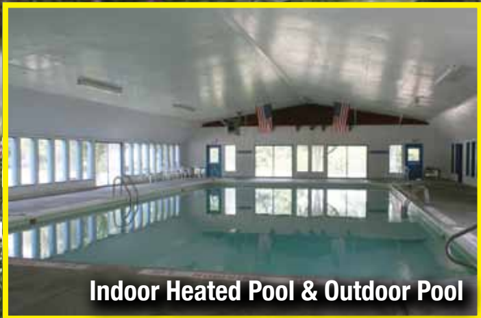
Indoor Heated Pool & Outdoor Pool