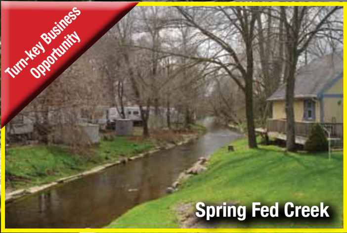
Spring Fed Creek