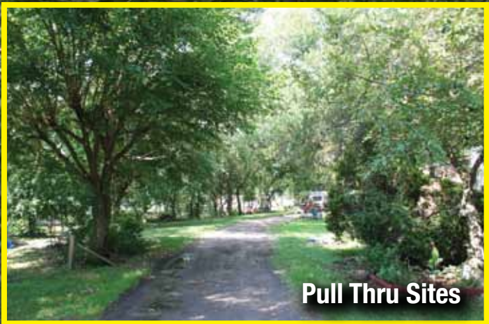
Pull Thru Sites