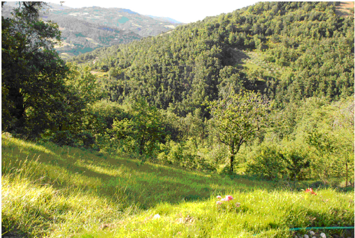
The Magic Valley (as we call it) – there's bags of inspiration here