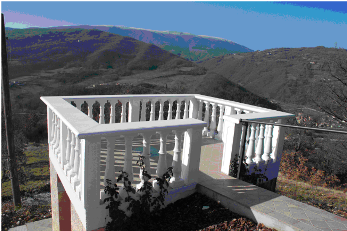
One of our terraces – an excellent site for writing early in the morning