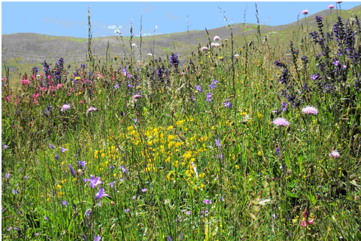
Piano Grande (big plain) in Spring