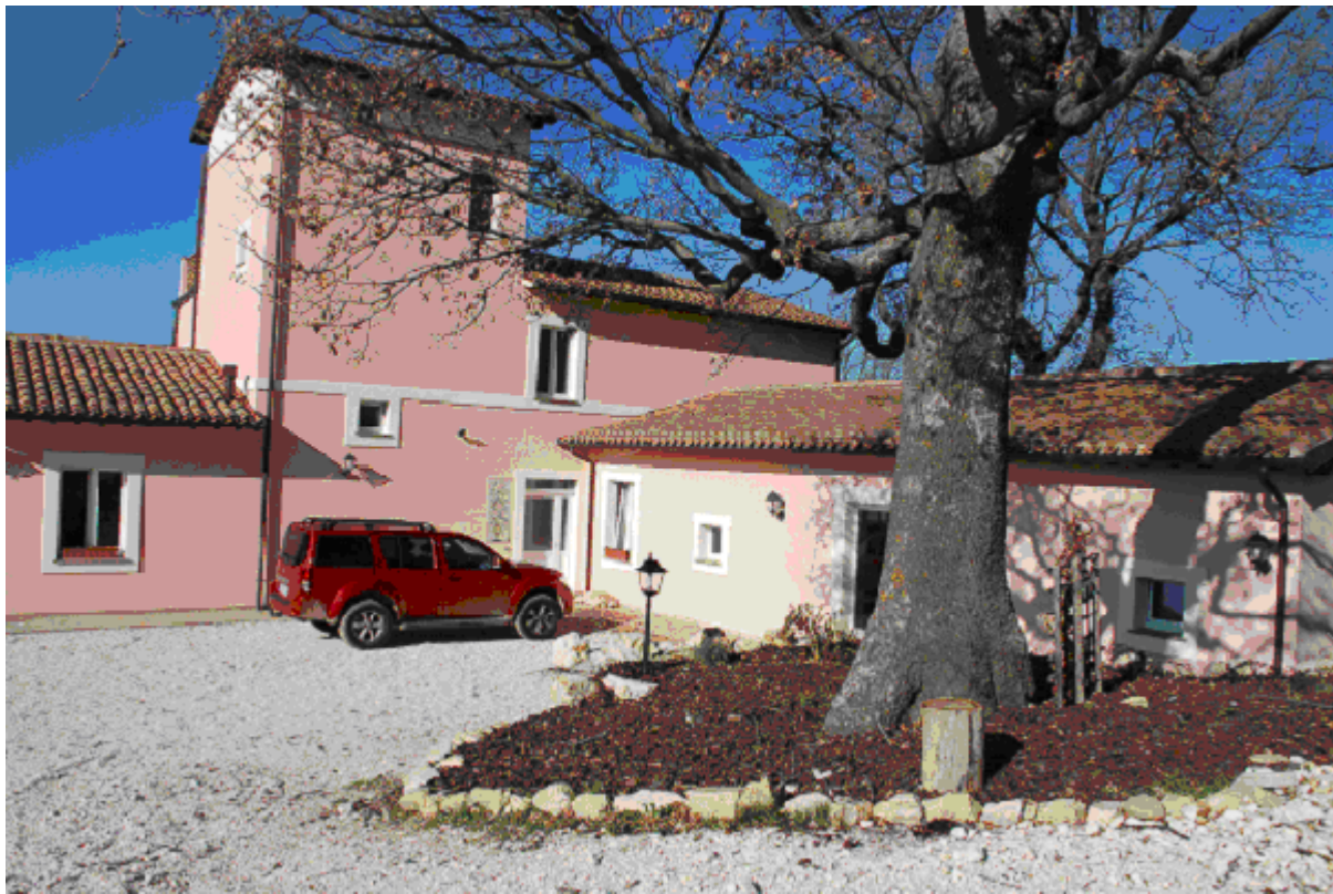
The house in Winter sunshine