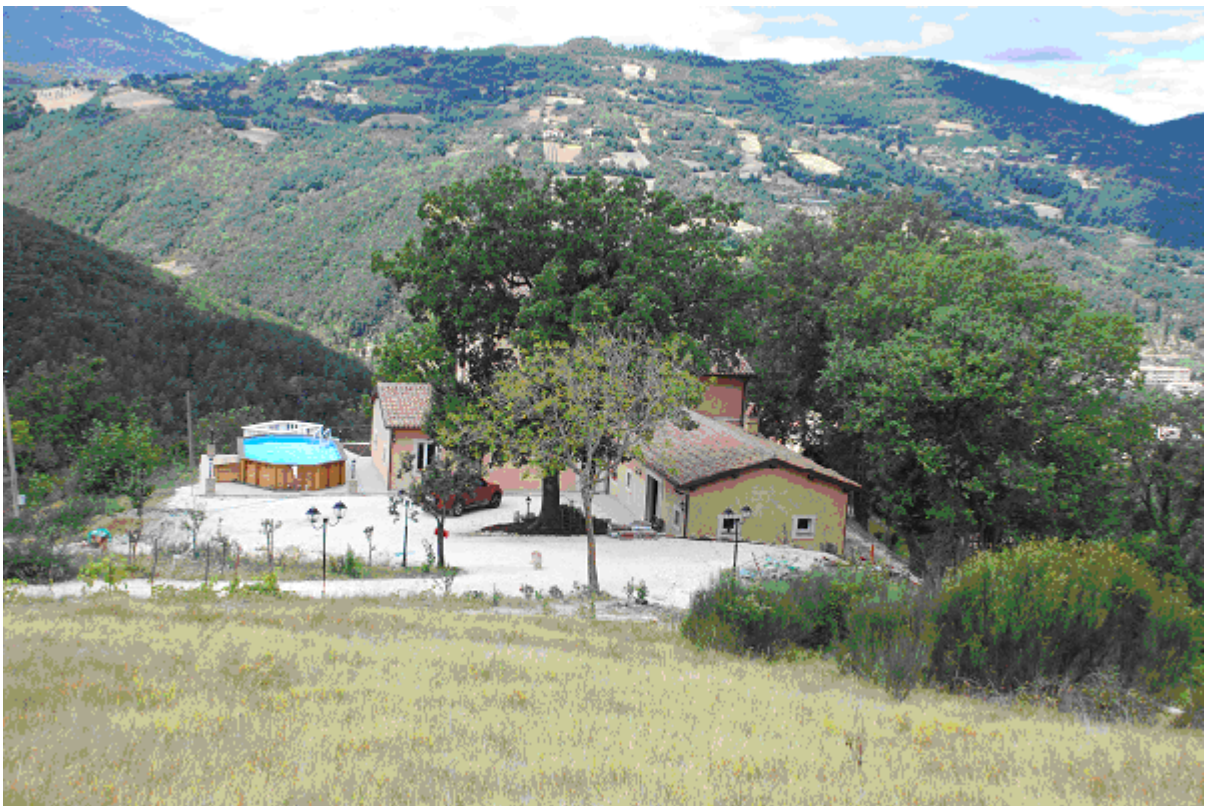
House from our hill – just the spot for planning a novel