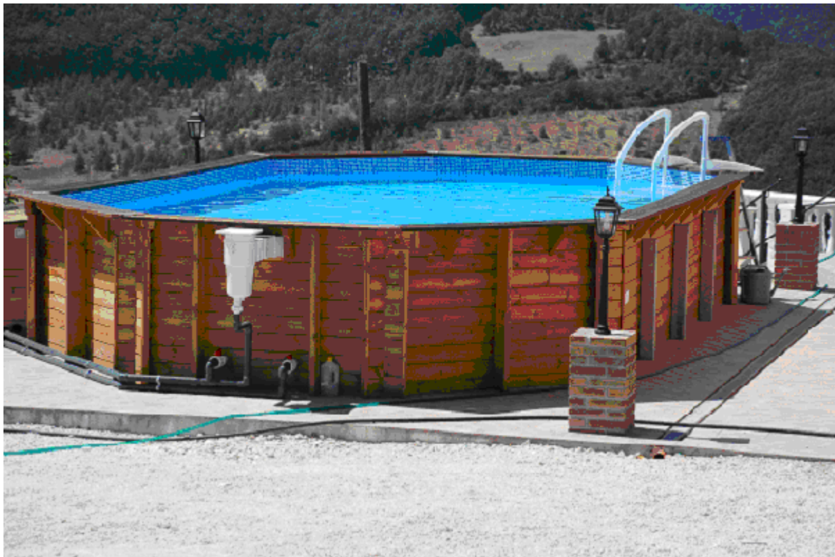
Outdoor swimming pool (about 40 square metres)