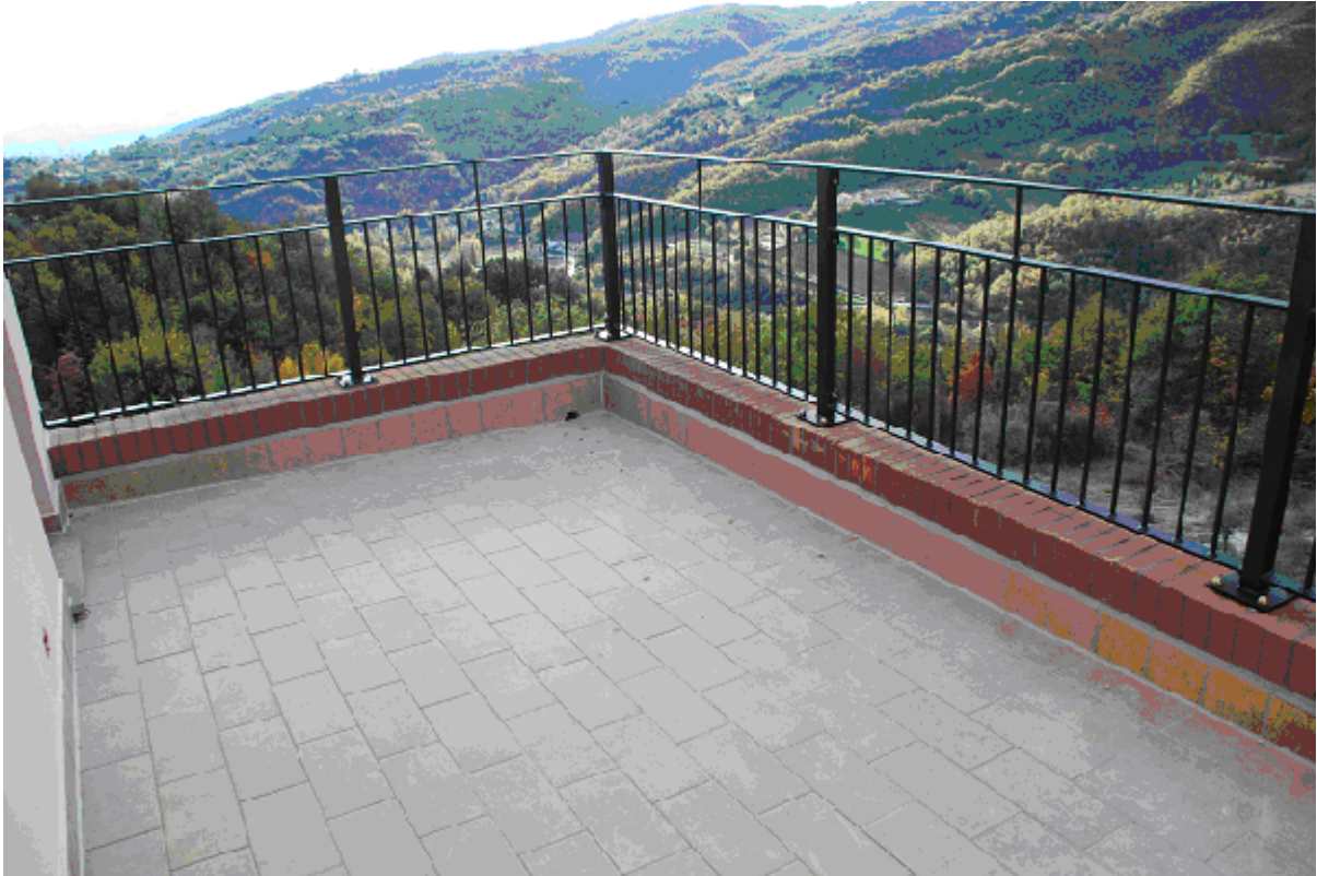
Second floor terrace (dove cote) – watch the world go by and the sun go down