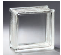
THICKSET® 90 Block, VUE® Pattern