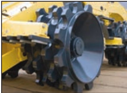
Soil compaction wheels with adjustable scrapers in front of and behind each wheel.