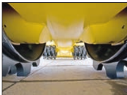
Smooth undercarriage fully protects drive components.