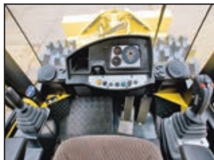
Excellent visibility from the ergonomic operators station.