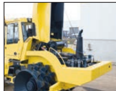
Efficient component access from the vertically opening hood.