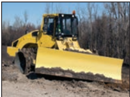
Versatile Tilt Blade.