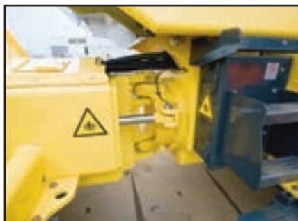
Oscillating center articulation joint ensures ground contact by all four wheels.