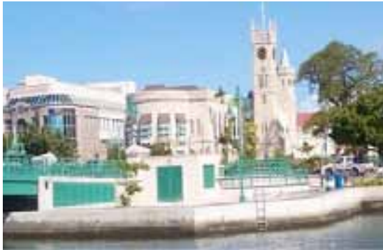
Barbados World Heritage Volume 1, Issue 1