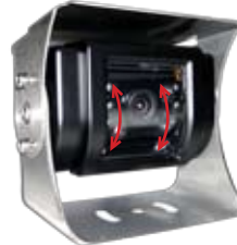
Vertical Tilt - Camera (camera lens automatically pivots up/down w/ trigger inputs)