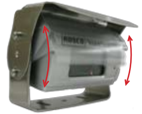
Shutter Camera (camera lens is protected by automatic lens cover)