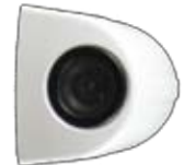
Side Mount Camera (universal left or right side mount camera)