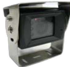
Standard Camera (included in kit)