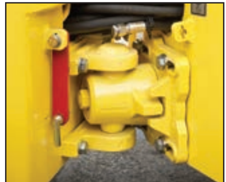
Maintenance free bolt on articulated / oscillating joint.