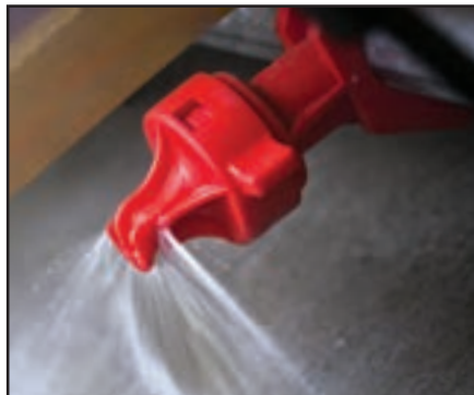
Wind screen protected water spray nozzles with integrated filter provides uniform coverage.