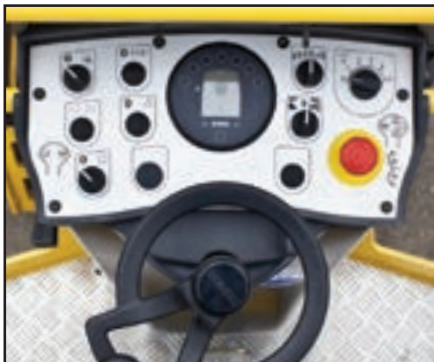
Clear operation and indicator controls with a new ergonomic steering wheel for maximum comfort.