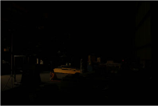
A dark warehouse, lit only by a distant 75W incandescent bulb.

This light tower is constructed of aluminum and provides for both height adjustment and leg placement assuring a steady and stable platform. Included with this unit are two 400 watt metal halide lamps and 50 feet of abrasive and oil resistant SOOW cord terminating in an ECP 1523 5-15P Class 1 Division 1 explosion proof straight blade plug. The explosion proof light fixtures can be removed by releasing the hand knob and sliding the light and mounting bracket off of the quadpod center support while the legs can be collapsed, aiding in deployment, storage and transport. This tower is rated for use in wet areas and marine environments and operates on 120 VAC.