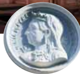
Bas relief of Queen Victoria on Queen's Park Gallery Facade