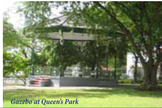
Gazebo at Queen's Park

Bridgetown’s architecture, says the UNESCO announcement, consists “of a well-preserved old town built in the 17th, 18th and 19th centuries, which testifies to the spread of Great Britain’s Atlantic colonial empire”.