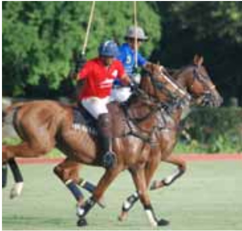
Barbados World Heritage Volume 1, Issue 1