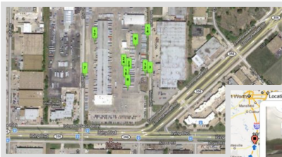
Monitor From Anywhere

Our GPS Tracking software is "In the Cloud", so there is no need to burden your IT department. Training is minimal, because we utilize Google Maps®.