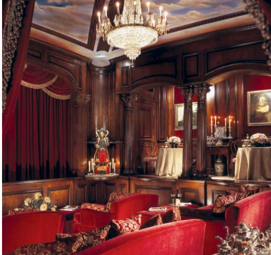
high-performance home theatre