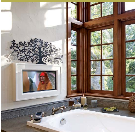
distributed music & video

“I highly recommend DSI Entertainment Systems for any type of high-performance audio/video entertainment and home automation system. They are organized, efficient and extremely competent; they definitely know their trade. ”