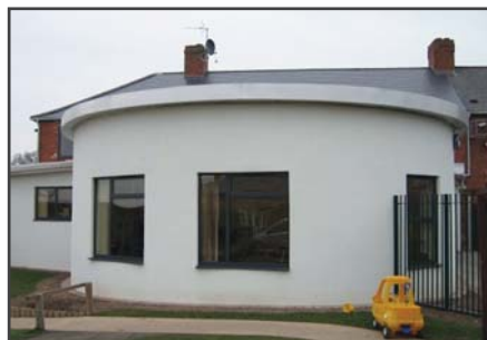
No limitations with design or construction options