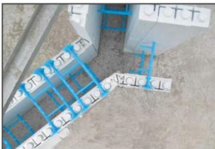
Fast, simple and flexible with minimum waste

ICF construction provides a highly insulated monolithic structural concrete core around the footprint of the building which allows precast concrete upper floors and stairs to easily be incorporated if required.