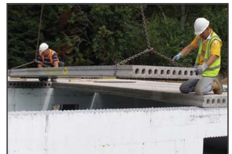
Easily complies with existing and future Building Regulations