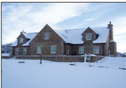
Airtight and energy efficient with consistent internal air temperatures