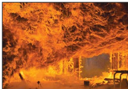
Fire safe with greater retardation than traditional building methods