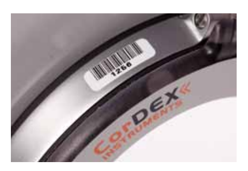
Unique IR Window identifiers using RFID, Barcodes and Serial Numbering