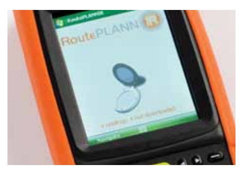
RoutePLANNIR™ database software