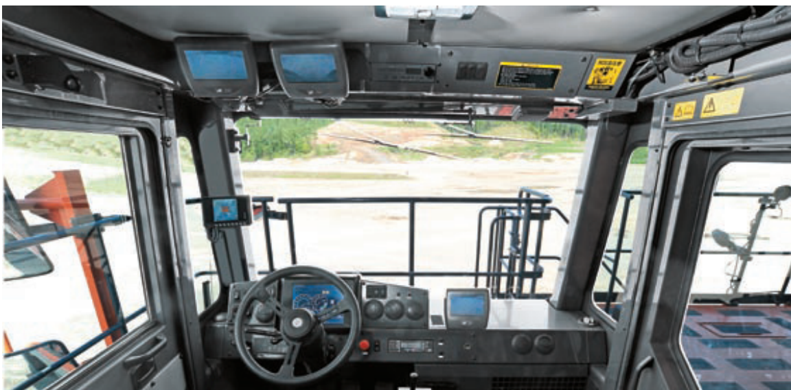
Left: SkyAngle system display monitor integrated in EH5000AC-3 cab (optional).

As part of continued initiatives to promote safety, SkyAngle will initially be equipped on mining dump trucks with future plans to expand the new technology to other products such as Hitachi's giant hydraulic excavators. The application of this monitoring technology will set the benchmark in the area of on-site safety for mining companies across the globe.