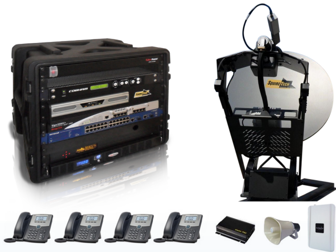
Squire Tech Solutions MR 600 equipment shown above.

Equipment Packages and Service Plans offer low satellite latency, high quality audio and video for live mobile response applications. Our small antennas fit easily on pCom® Response Trailer, Command Center, SUV or can easily be added to an existing trailer or vehicle. Automated hardware operation and bandwidth access free up valuable time to focus on other vital response tasks.