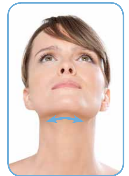
Under the chin