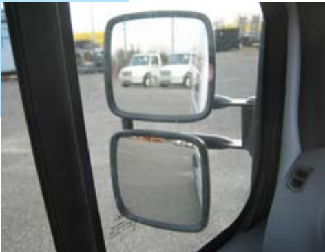
Full Left Side Assembly from Driver Eye-Point View P/N : 6651LB