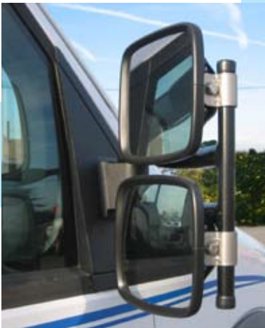
Full Right Side Assembly P/N : 6651RB

Rosco's new TC Dual Rearview Door Mirror System was designed specifically for Ford Transit Connect vehicles. This system which offers a generous mirror viewing area on two separately adjustable mirror heads allows drivers to optimize mirror angles and locations to cover all blind spots and danger zones. Offering more than 50% more viewing surface area than standard mirrors, the TC Dual Rearview Door Mirror System will provide drivers enhanced safety through all maneuvers and operations. The wider field of view and the exceptional stability allows the mirrors to provide a clear image of the passing lanes and blind spots around the vehicle leading to improved safety and faster driver reaction time.