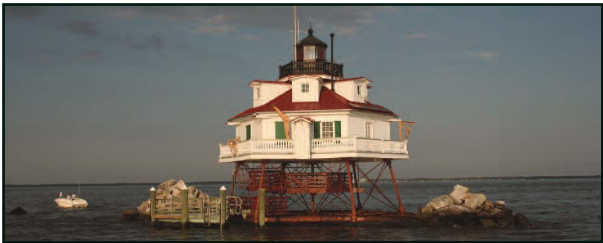
Thomas Point Shoal Lighthouse, Chesapeake Bay.