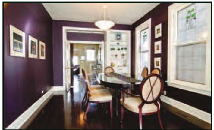
Eurolux from Inspiration Collection (G17150).