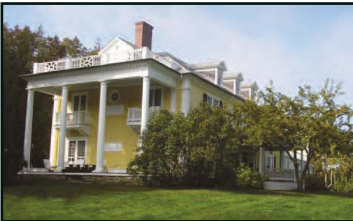
Elegant Northeast home.