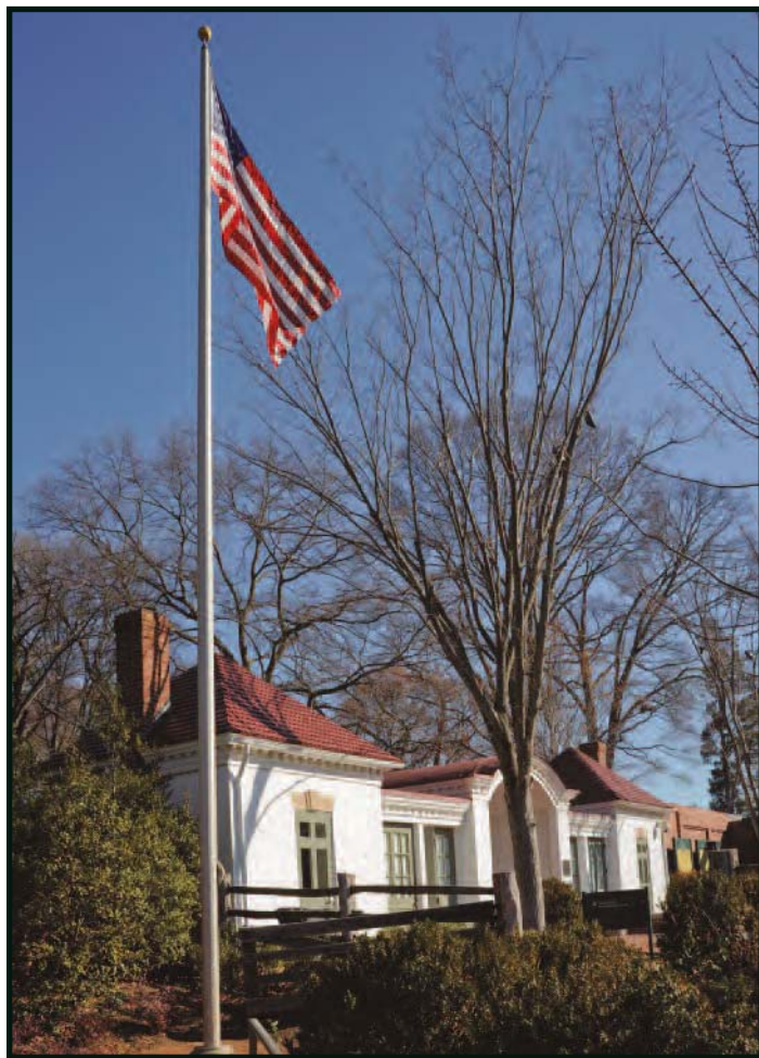
Texas Gate, Mount Vernon's main visitor entrance.