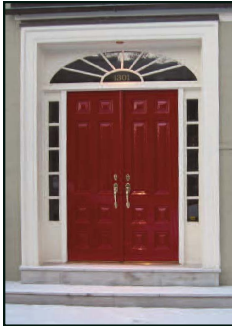
Eco Brilliant Rembrandt Red.