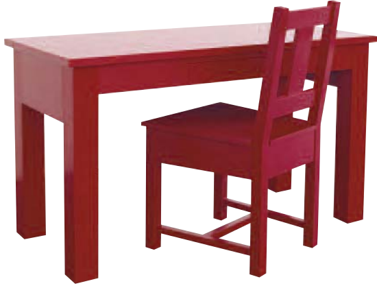
Priceless Roy McMakin table.