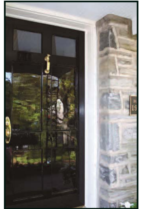
Hollandlac Brilliant door.