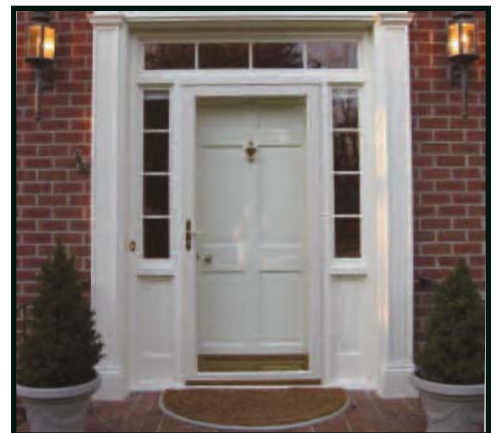
Hollandlac Brilliant white entranceway.