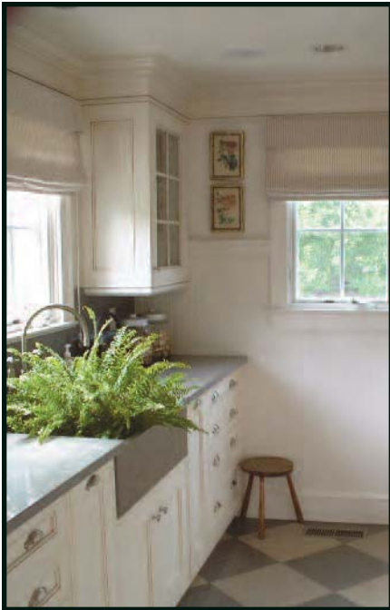
Classic white Hollandlac kitchen.