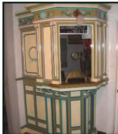
Restored theater ticket booth.