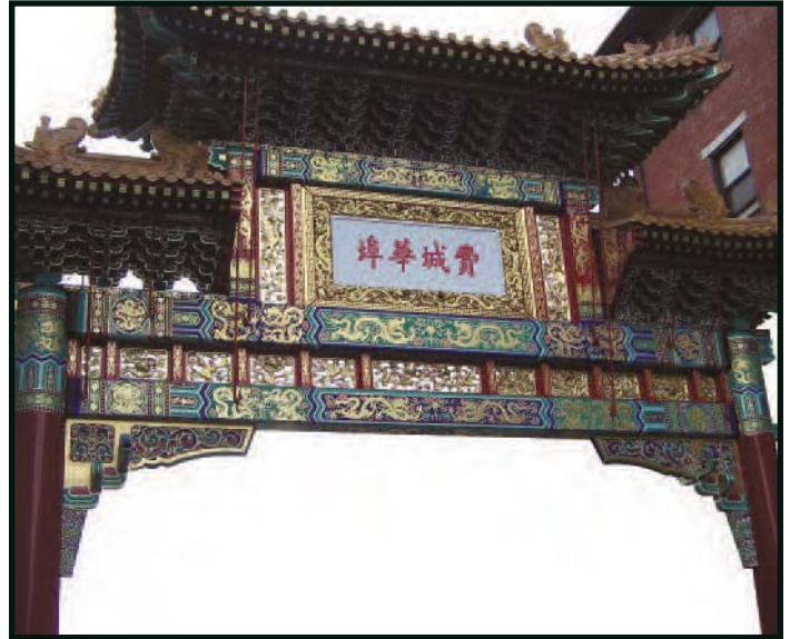
China Gate, Philadelphia.