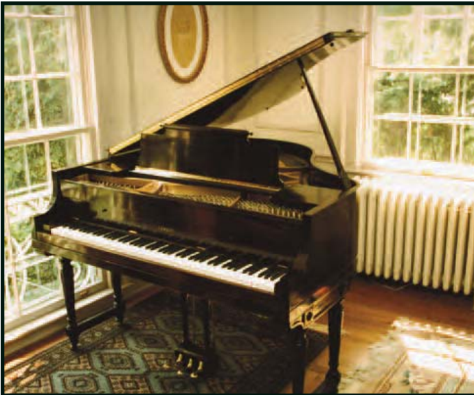
Hollandlac Brilliant black piano.