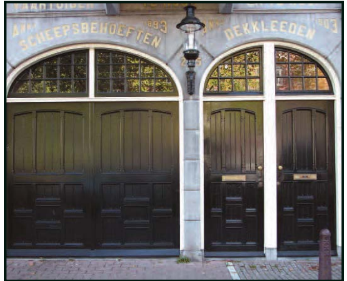
Classic Amsterdam entranceway.