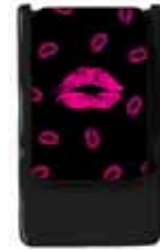
PUCKER UP PINK