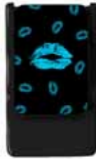
PUCKER UP BLUE

FlyGrip has partnered with Emma New York to bring you a designer line that is bright and fun. We hope you enjoy them as much as we do!