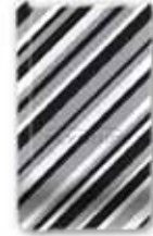
STRIATED BLACK & GRAY