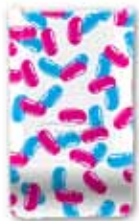
SWEET BEANS BLUE & PINK