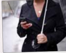
TWEET IN THE RAIN