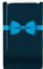
TIE ME UP BLUE