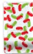
SWEET BEANS GREEN & RED