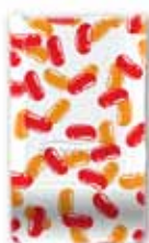
SWEET BEANS RED & ORANGE