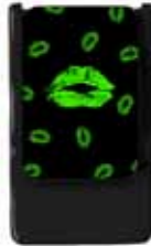
PUCKER UP GREEN