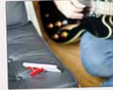
KICKSTAND YOUR WAY