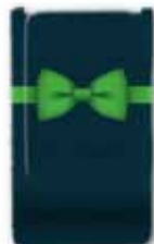
TIE ME UP GREEN