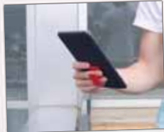
READ WITH EASE