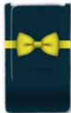
TIE ME UP YELLOW