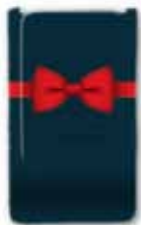
TIE ME UP RED