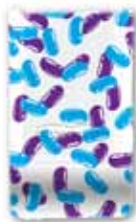
SWEET BEANS PURPLE & BLUE