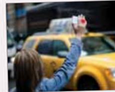
CONVENIENT FOR TRAVEL