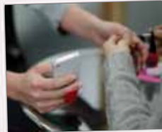
TEXT IN STYLE