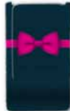
TIE ME UP PINK