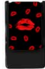
PUCKER UP RED