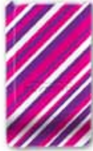
STRIATED PINK & PURPLE