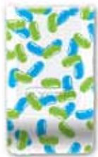
SWEET BEANS BLUE & GREEN