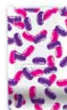
SWEET BEANS PINK & PURPLE