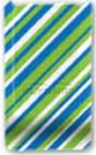
STRIATED BLUE & GREEN