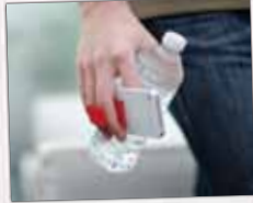
ON THE RUN