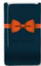
TIE ME UP ORANGE