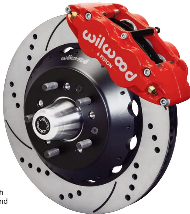
Big Brake Front Kit with SRP Rotor and Red Caliper

Download High Resolution Photo, click here