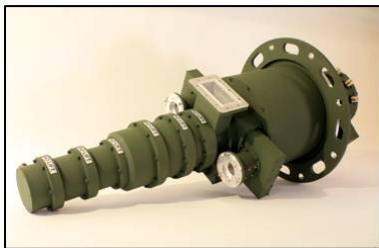
Diamond Antenna 6 Channel Rotary Joint with integrated Roll-Ring®

A number of significant military equipment customers chose Roll-Rings® for their mission critical applications. NASA, the US Navy, Raytheon and others have subjected Roll-Rings® to full qualification testing and in each case Roll-Rings® have passed. Roll-Rings® deliver mission critical performance by offering advanced capabilities and lower cost of ownership as compared to slip rings. Roll-Rings® can be adapted for most applications. The RFQ section of the website is the best way to start the conversation with a Roll-Ring® Engineer to see if Roll-Rings® are the answer for your mission critical application.