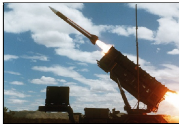
Patriot Missile System with a Roll-Ring®