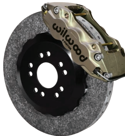
WCCB Big Brake Front Kit For high resolution photo for printing, click here