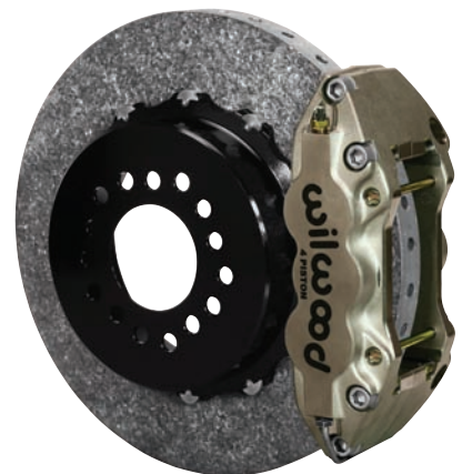
WCCB Big Brake Rear Kit For high resolution photo for printing, click here