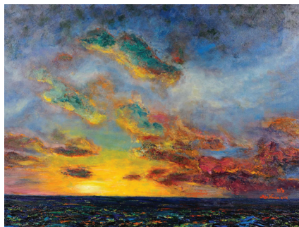
Out Of Chaos

Chelsea, New York City 212-226-4151 Fax: 212-966-4380 WWW.AGORA-GALLERY.COM WWW.ART-MINE.COM