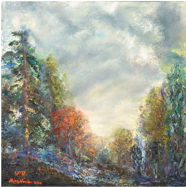
Divine Presence Oil on Canvas 24" x 24"

Exhibition Dates: November 27 - December 18, 2012