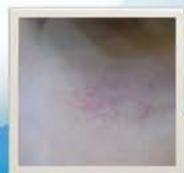
CLINICAL IMPROVEMENT IN SCAR TISSUE