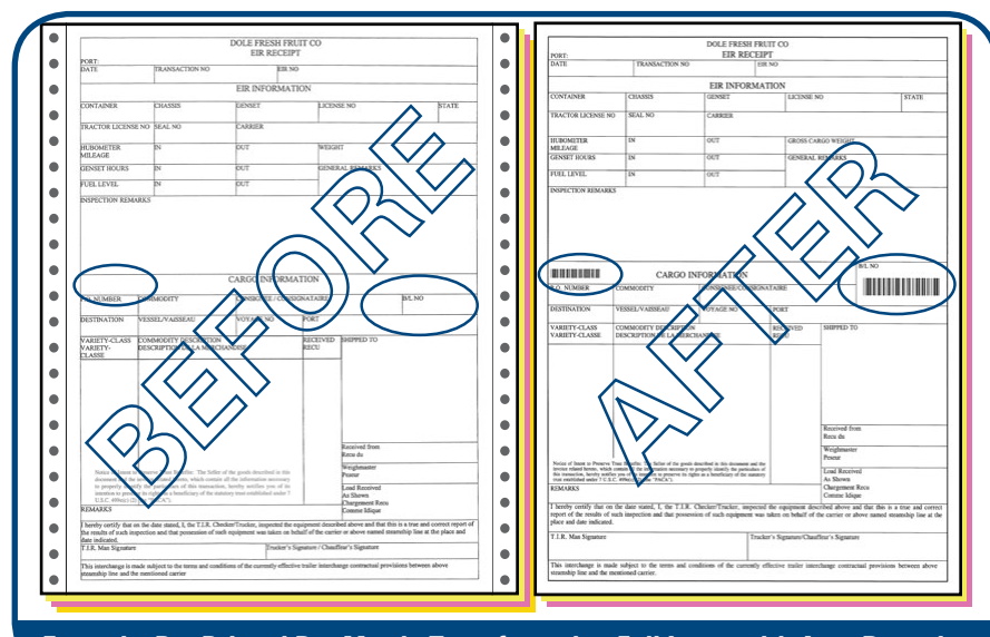
Example: Pre-Printed Dot Matrix Transformed to Full Laser with Auto-Barcodes