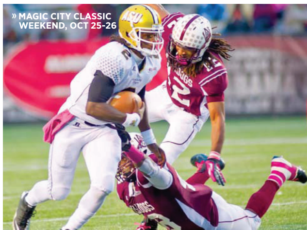
» MAGIC CITY CLASSIC WEEKEND, OCT 25-26

www.themagiccityclassic.com . Admission charged. Legion Field. The Alabama A&M University Bulldogs of Huntsville and the Alabama State University Hornets of Montgomery meet annually in Birmingham for this traditional football rivalry featuring exciting half-time band action. This is the largest black college football rivalry in the country. Please check the website for all the latest information, including pre-game activities.