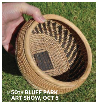
» 50TH BLUFF PARK ART SHOW, OCT 5

www.bluffparkartshow.com . Free. Bluff Park Community Center & Park. Always held on the first Saturday in October, this juried fine arts show attracts the best artists in the southeast and beyond for a one-day celebration of artistic talent. Meet the artists and enjoy seeing and purchasing their works of art in a beautiful wooded park setting. 9 a.m.-5 p.m.