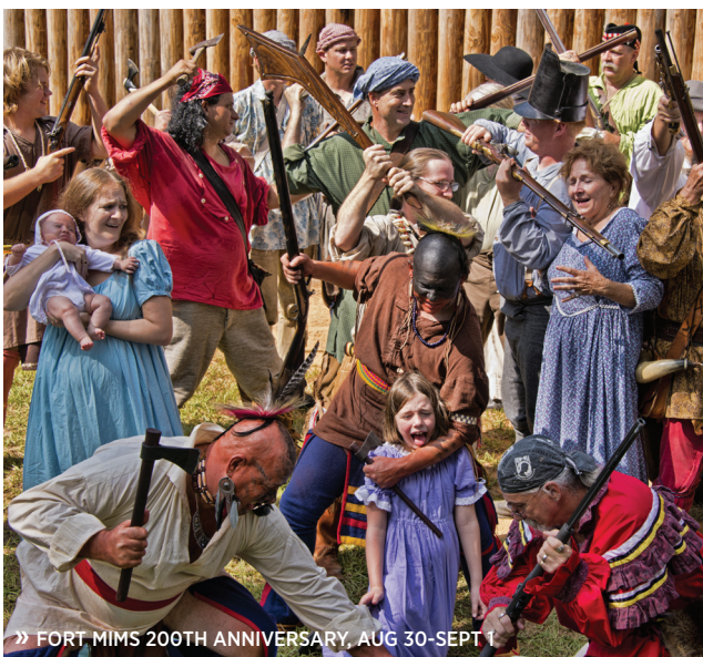
» FORT MIMS 200TH ANNIVERSARY, AUG 30-SEPT 1

www.alabama.travel . Various restaurants throughout the state. Restaurants around the state, including many featured in the popular brochure "100 Dishes to Eat in Alabama Before You Die," invite diners to experience the wonderful culinary scene of Sweet Home Alabama. Participating restaurants will offer special fixed-priced meals for lunch and/or dinner and other specials throughout the week.