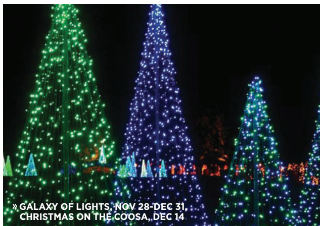
» GALAXY OF LIGHTS, NOV 28-DEC 31, CHRISTMAS ON THE COOSA, DEC 14

www.wetumpkachamber.com . Free. Gold Star Park & Courthouse Veranda. Christmas extravaganza with arts and crafts, parade, food, quilt show, classic car show, entertainment and activities on the Coosa River culminating with a spectacular fireworks exhibition at dusk.