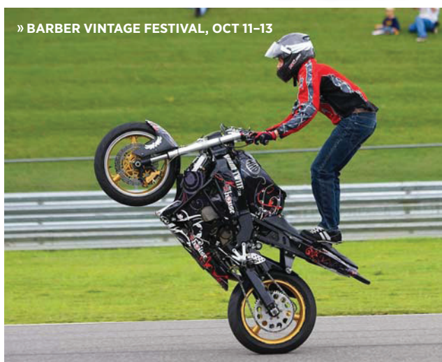
» BARBER VINTAGE FESTIVAL, OCT 11-13

www.barbervintagefestival.org . Admission charged. Barber Motorsports Park. Featuring road racing, motocross, cross country events, an air show, a swap meet with more than 250 vendors, a fan zone and more.