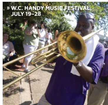
» W.C. HANDY MUSIC FESTIVAL, JULY 19-28