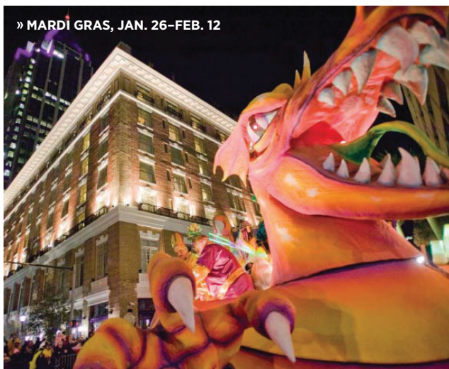
» MARDI GRAS, JAN. 26-FEB. 12

With nearly 1,900 events scheduled in 2013, there's plenty to engage visitors in Alabama. Here, we present the state's top 10 for the year, either because they'll happen only once or because they're so unique you won't want to miss them. In addition, we list the top 10 by month, by region. Which ones will you attend?