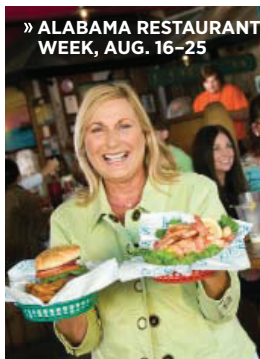
» ALABAMA RESTAURANT WEEK, AUG. 16-25

www.wchandymusicfestival.org . The Shoals (Florence, Sheffield, Tuscumbia and Muscle Shoals), various locations. Weeklong celebration honoring Florence native, W.C. Handy, "Father of the Blues," with more than 200 events taking place including concerts, plays, art exhibits, picnics and more.