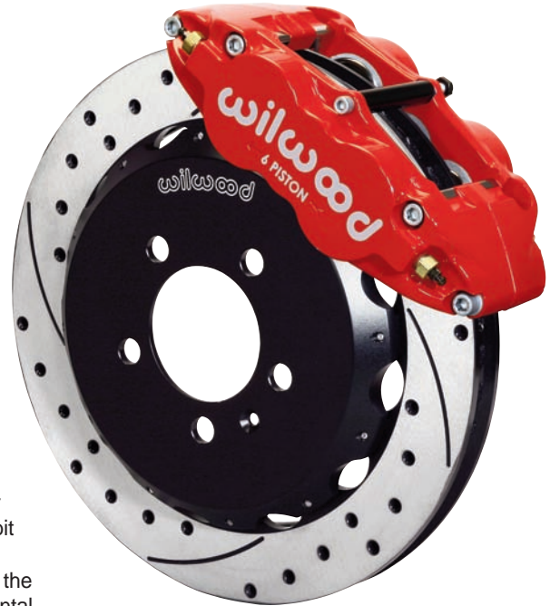
Big Brake Front Kit Assembly with Red Caliper and SRP Rotor