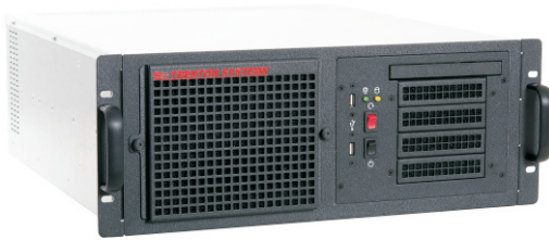
Trenton TVC4406 Video Controller Shown with an ATX motherboard