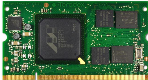
Colibri PXA270 Computer on Module

Toradex continues to expand the Colibri family of modules which have been swiftly adopted by a diverse range of industries around the globe. Today the Colibri family contains ten pin and functional compatible module variants utilising Marvell PXA and NVIDIA® Tegra™ System-on-Chips (SoC) and ships to thousands of customers.