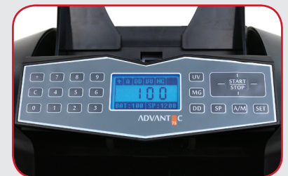
Easy to read display