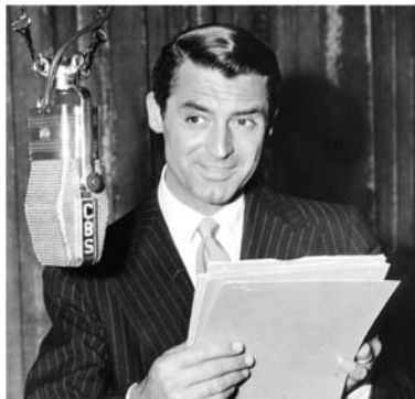
★ Cary Grant