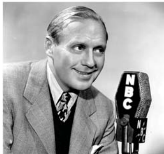
★ Jack Benny