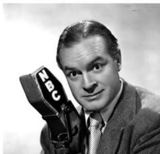
Bob Hope ★

Host Your Very Own Weekly Radio Show heard Nationally on Hollywood 360 (60-90-120 seconds in duration).