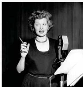
Lucille Ball ★