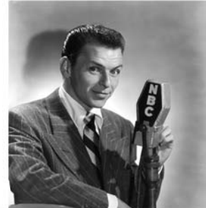
★ Frank Sinatra