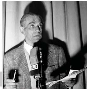
★ Boris Karloff