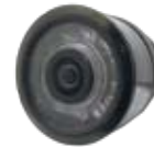
Bullet Camera P/N: STSC106