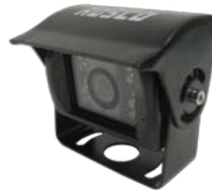
Standard Camera (Included)