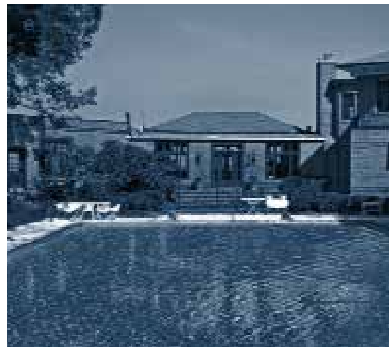
Coldwell Banker Previews International® Significant Sales YTD 2012