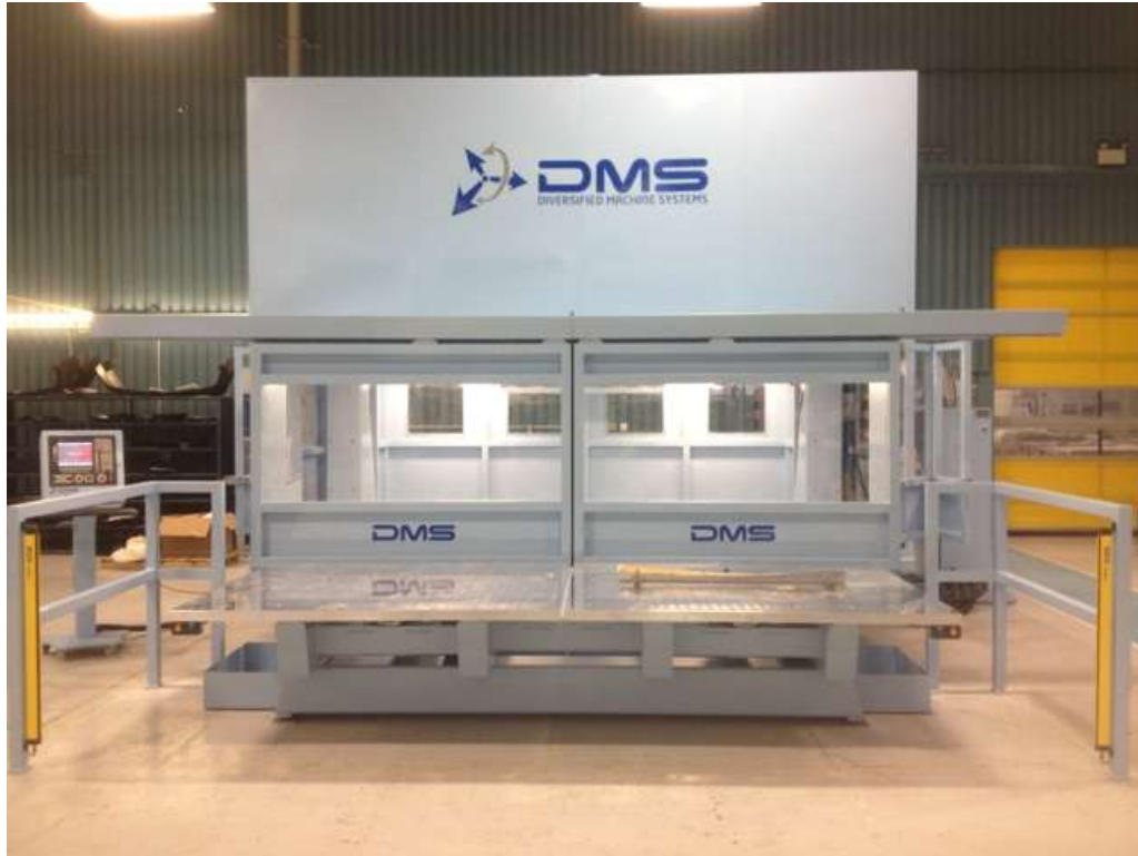
Model 5T5-6-5-48T Shown