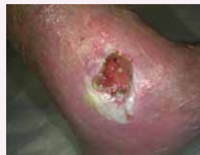
Figure 2b: Step 2: the user draws wound boundary on interactive SilhouetteConnect software screen to generate area, depth and volume data for wound.