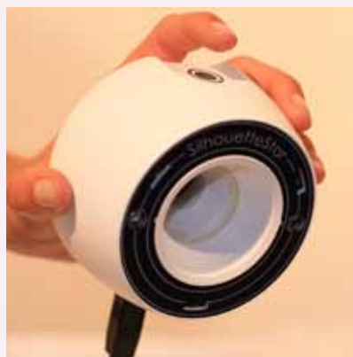
Figure 1: SilhouetteStar camera for digital wound imaging and 3D wound measurement.

NHS Improvement (2012) EQIPP Delivering Quality Efficiently . Available at: http://www.improvement.nhs.uk/Default.aspx?alias=www.improvement.nhs.uk/qipp (accessed 19 October, 2012)