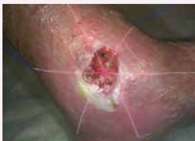
Figure 2a: Step 1: the SilhouetteStar camera allows users to capture digital wound image and 3D wound measurement to support non-contact, quantitative, objective wound assessment.

Quan, SY Lazurus, GS, Kohli, AR, Kapoor R, and Margolis DJ (2007) Digital imaging of wounds: are measurements reproducible among observers? Lower Extremity Wounds 6(4): 245–48