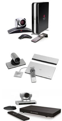
Other Bundle options can include the Polycom HDX (top), Cisco SX Series (mid) and Avaya RADVISION XT Series (lower)

As an end-to-end solution integrator, VideoCentric is also offering the ability to include all associated services and accessories required into the bundles. This not only includes additional VideoCloud™ services such as Recording and Streaming services, ISDN, Skype and Lync Connectivity, Monitoring and Management, but also installation and training, bandwidth rental, LCD/Plasma displays, touch panel controllers and even brackets, trolleys and mounts.