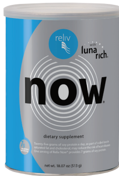
Reliv Now® Essential Nutrition

Concentrated lunasin provides its own health benefits and powers up the nutrients in other Reliv products