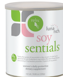
SoySentials® Women's Health

Patented protein-based formula to improve athletic performance, endurance, recovery and repair