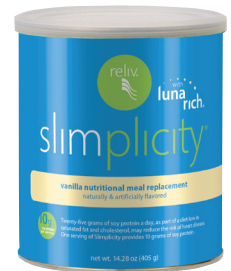
Simplicity® Weight Loss

Patented formula clinically shown to help maintain healthy blood sugar levels and support weight loss