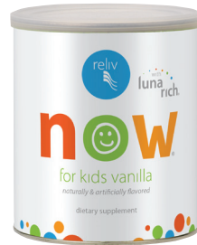
Reliv Now® for Kids Children's Health

Complete, balanced array of protein, vitamins, minerals and super-powered antioxidants