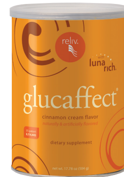
GlucAffect® Blood Sugar Management

Soy isoflavones, antioxidants, probiotics and herbs to ease menopause and PMS and promote overall feminine health