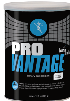
ProVantage® Performance Nutrition

Essential nutrients to keep growing bodies healthy, plus advanced ingredients to boost energy and mental performance