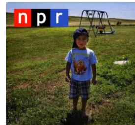
Reviewing the Facts: An Assessment of the Accuracy of NPR's Native Foster Care: Lost Children, Shattered Families

On October 25-27, 2011 National Public Radio aired a major, three-part exposé on Lakota foster care in South Dakota. The hard-hitting report was heard by 28 million listeners and won a Peabody Award for excellence. NPR impugned South Dakota for taking $100 million in federal money each year to support foster care, while disregarding the Indian Child Welfare Act's mandate that Native American children be kept with their extended families and tribes. According to NPR, and also to a special report issued by the nine Indian Child Welfare Act Directors from South Dakota, half of foster children in South Dakota are Native American—but nine in 10 of them are placed by DSS with white families while some licensed Native American foster homes sit empty. 66