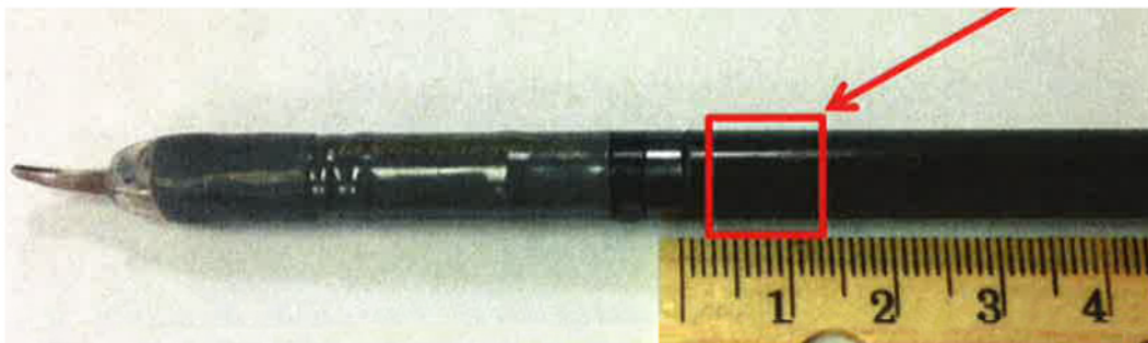
Figure 1: Location of micro-cracks

Certain -09 and -10 versions of the MCS instruments may develop micro-cracks near the distal (scissor) end of the shaft following reprocessing. This may create a pathway for electrosurgical energy to leak to tissue during use and potentially cause thermal injury. The affected area is shown in Figure 1 below and is confined to an approximately 1 cm section of the shaft, as indicated. These micro-cracks may not be visible to the user.