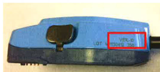
Figure 2: Location of version number on MCS Instrument and box label