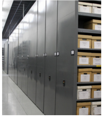
Spacesaver Powered Mobile Systems, outfitted with metal shelving, Delta Design Museum Storage Cabinets and heavy-duty pallet racks, were used to store the current artifact collection