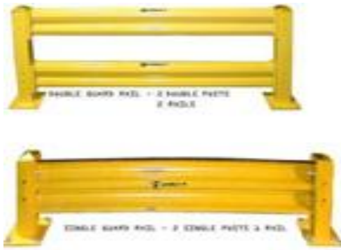
Heavy Duty Guard Rail