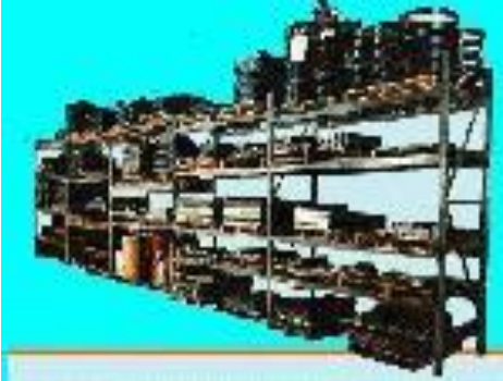
Structural Racks – Massive Capacity