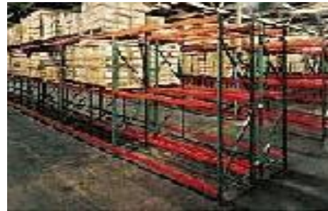
Good Old Tear Drop Pallet Rack – Available pre-configured also!