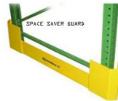
Rack Column Protector