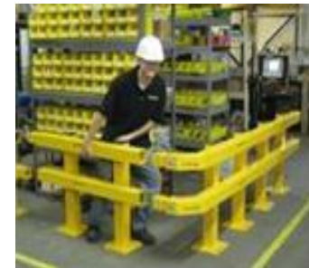
Stackable Guard Rails