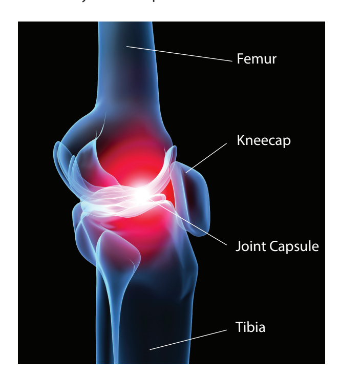
Hyaluronate is injected into the joint capsule through the side of the knee.

Pain relief is not immediate but usually takes place after the third or fourth day. It is best to take anti-inflammatory and/or pain medicine until the hyaluronate provides relief.