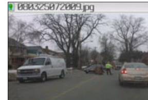
MPATrack video - Java BlackBerry