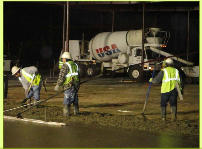
Optimized mix delivered by USA Ready Mix