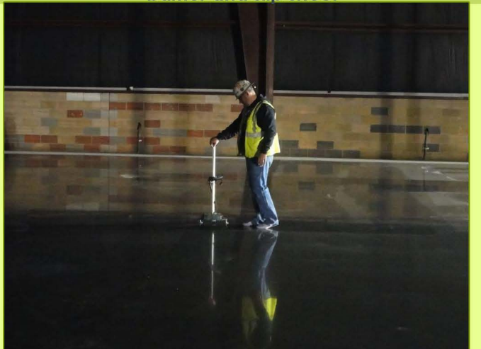
World-record flatness – Ff 123/FI 123