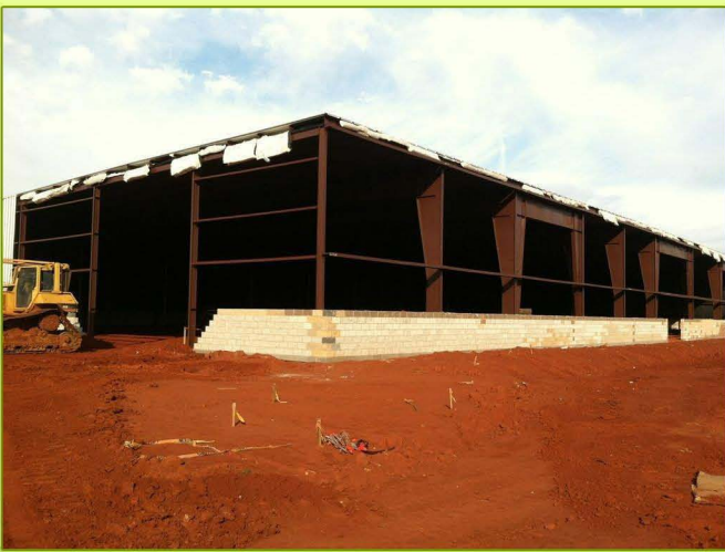
Exterior Rigby's Family Fun Center