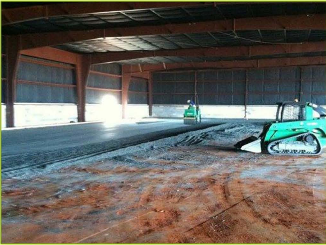
Compacted base on Georgia clay