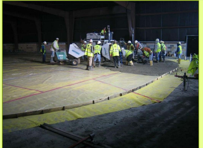
Georgia-buggy delivered onto vapor barrier and slip sheet