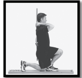
In-Line Lunge (Functional Movement)