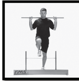
Hurdle Step (Functional Movement)