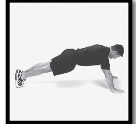
Trunk Stability Push Up (Fundamental Core Strength)