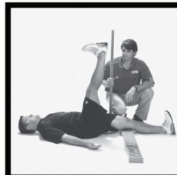
Active Straight Leg Raise (Fundamental Mobility)