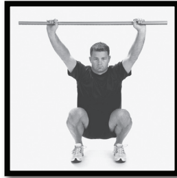
Deep Squat (Functional Movement)