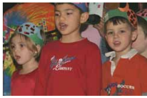
School age students participate in performances and cultural events throughout the year.

"Fluency in German certainly helped my daughter get into her first choice of college. It gave her that extra edge, and later helped her find a job as well."