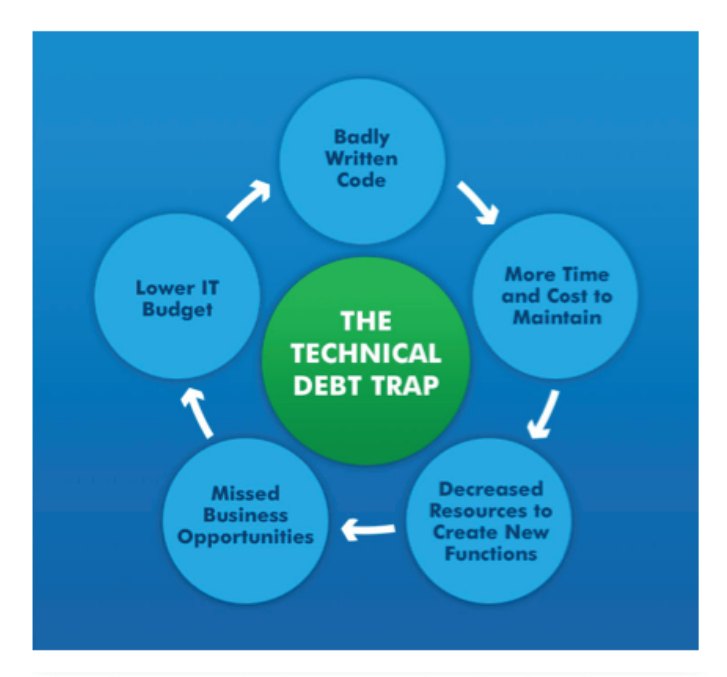
Fig. 2 - The Technical Debt Circle of Doom

Figure 2 highlights the trap companies can find themselves in when they do not invest in addressing the technical debt issue.