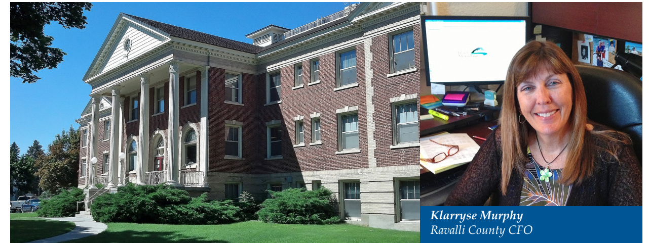
Klarryse Murphy Ravalli County CFO

A few months after the RFP process concluded with Ravalli County choosing to stay with Black Mountain Software and choosing to purchase rather than lease the software, Ravalli County CFO Klarryse Murphy summed up the experience saying, “Before we purchased Black Mountain’s software, I would have rated it around a 7. It was very useable, it was great. But the last few months, it’s been more like a 9 or 10. We know more about the software and what it can do for us and we are taking advantage of the services more. And I also think Black Mountain is improving.” Klarryse’s observation is right on. Around the same time that Ravalli County issued its RFP, Black Mountain Software launched an initiative to enhance and restructure delivery of support services to Montana counties. It seems that Black Mountain Software and Ravalli County share a philosophy: It’s good to periodically review your software products and services to ensure that you have the most beneficial and cost-effective solutions.