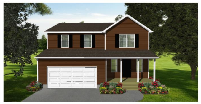
The Spruce Elevation