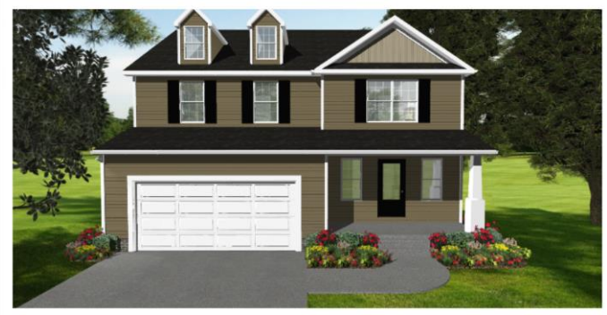
The Maple Elevation