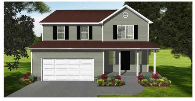
The Poplar Elevation