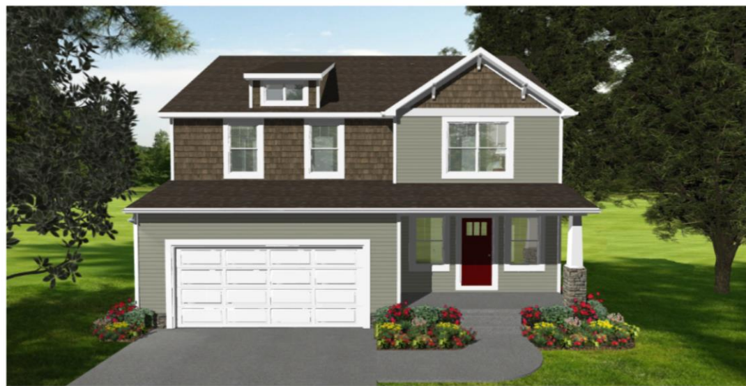
The Oak Elevation

Visit our website or call us today to speak with a sales person. Toll Free: 1-877-358-9199 www.sedgewickhomes.com