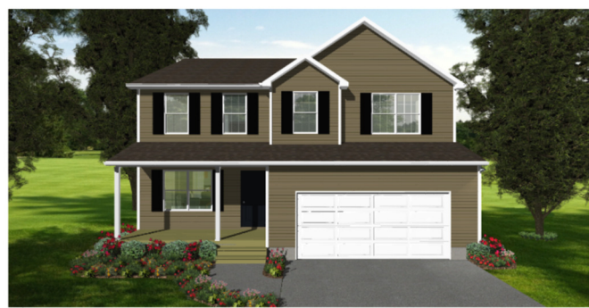
The Spruce Elevation