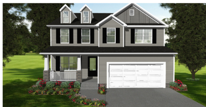
The Maple Elevation