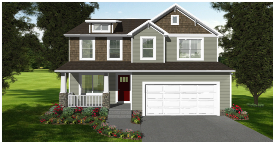
The Oak Elevation

Visit our website or call us today to speak with a sales person. Toll Free: 1-877-358-9199 www.sedgewickhomes.com