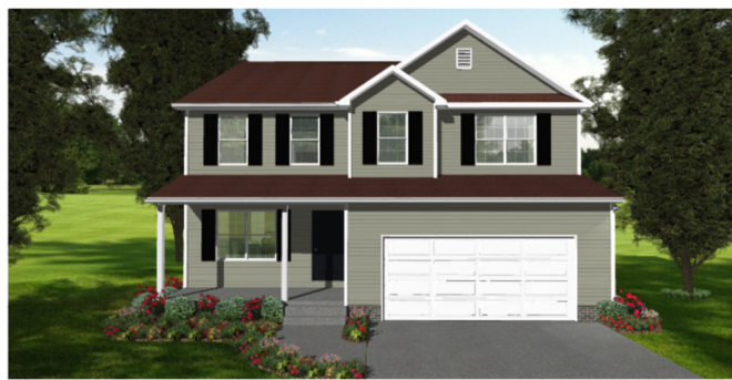
The Poplar Elevation